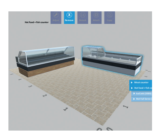
Custom Counter Configurator