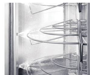
Fully automatic cleaning