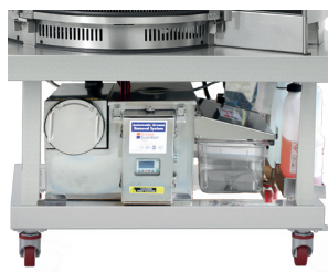
Hygienic fat collection